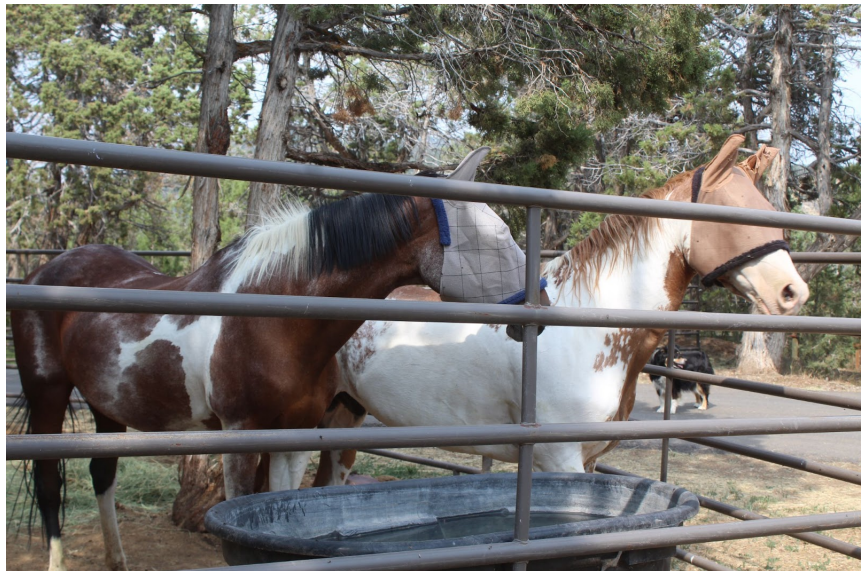
LOOT & SIENNA