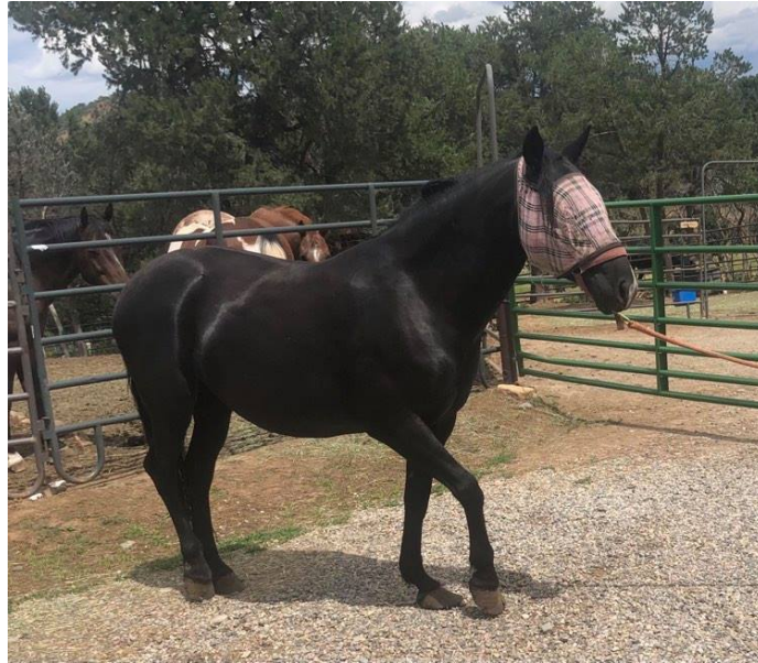
RAVEN (AKA MAMA)