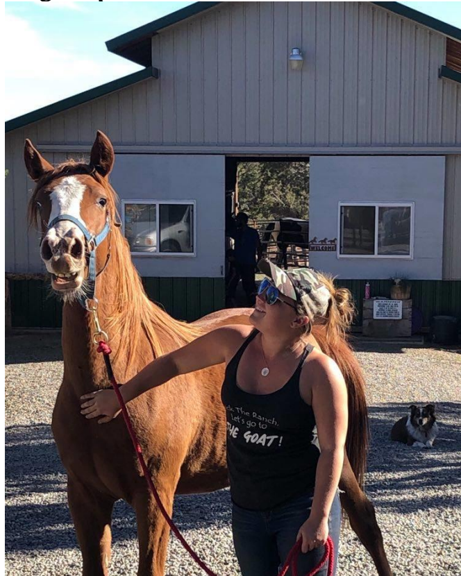
Robin in training

Spring has sprung ( hopefully) & the wind has been horrendous. It makes working in it rough when you are covered in manure & bedding, but hey the entertainment from the 4 legged crew thinking there is grass coming up ( a little) ` makes it worth it.